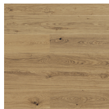
Pure Oak Rustic Plank