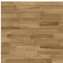
Pure Oak Nature TreS