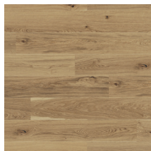
Pure Oak Rustic Plank XT