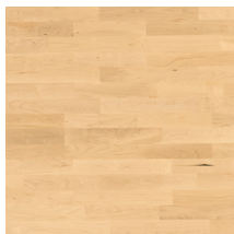
Pure Maple Nature TreS