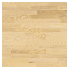
Pure Ash Nature TreS