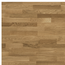
Pure Oak Nature TreS (brushed)