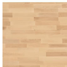
Pure Beech Nature TreS