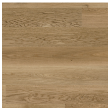
Pure Oak Nature Plank