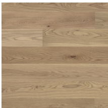
Pure Oak Antique Plank