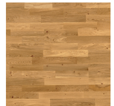
Pure Oak Rustic TreS