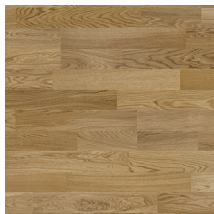
Pure Oak Nature DuoPlank