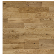
Pure Oak Rustic DuoPlank