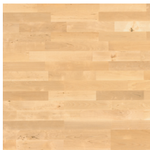
Pure Birch TreS