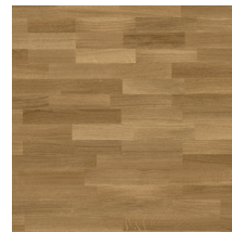
Pure Oak Select TreS