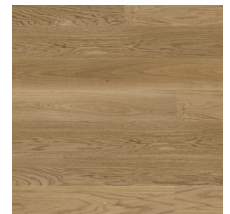
Pure Oak Nature Plank XT